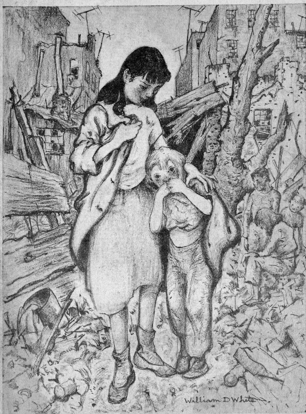
The plight of two ill-clothed and poorly housed children, reflective of the Twenty-Five Neediest Families appeal, is depicted in this pen-and-pencil sketch contributed by Illustrator William D. White of Wilmington.

Yet, housing surveys of the 1930s found that nearly half of Wilmington's 20,000 residential structures had no indoor toilets, and almost as many had no tub or shower; nearly three quarters lacked central heating. The State Housing Commission found that 80% of the city's people had incomes below $2000.