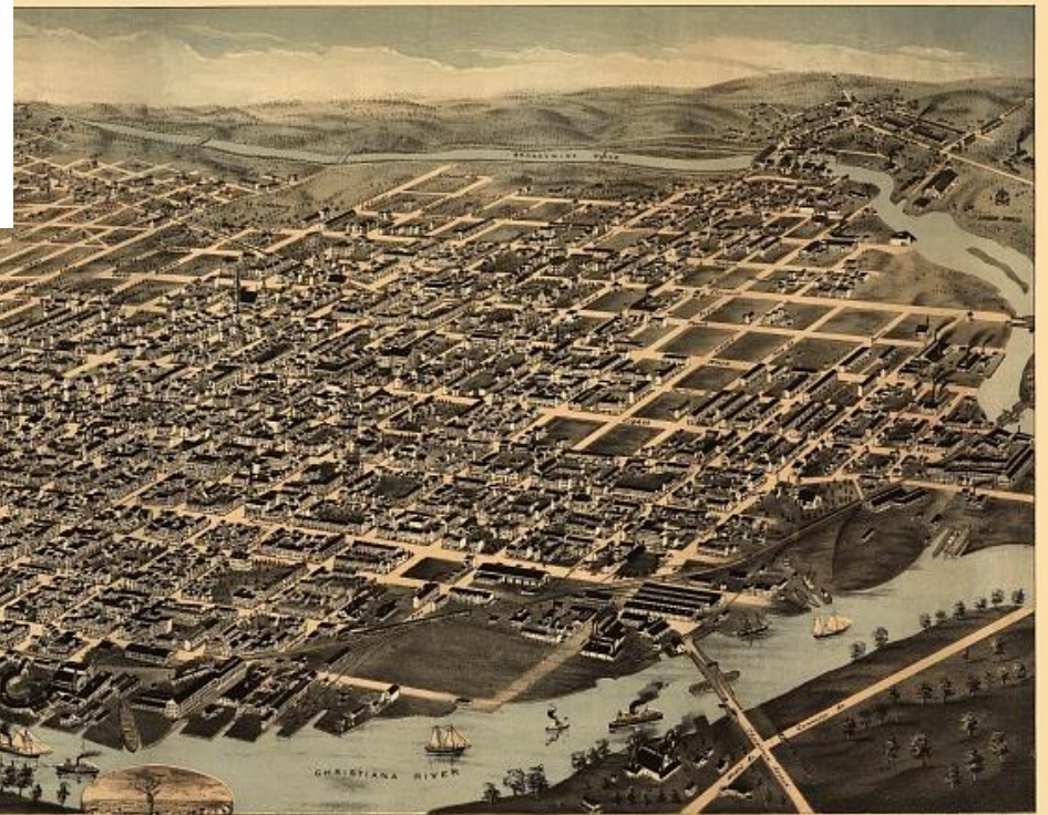
WILMINGTON, DEL. 1874.