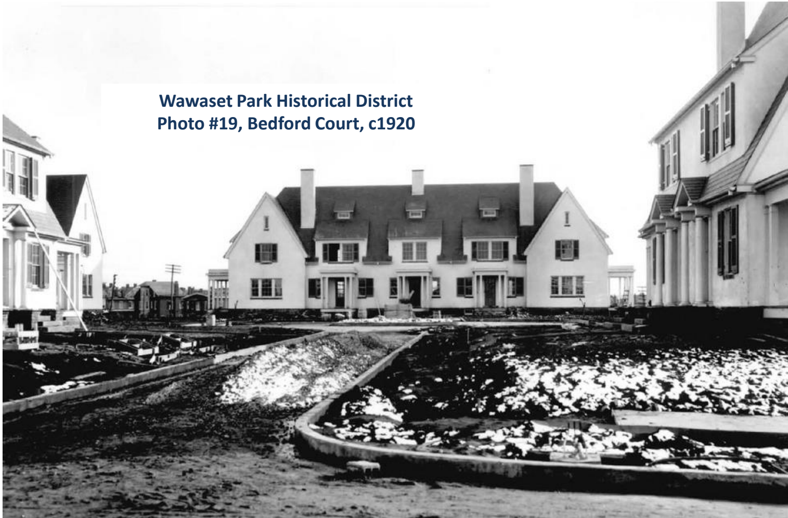
Wawaset Park Historical District Photo #19, Bedford Court, c1920

At the end of World War II, GI's who returned home to start families also left the crowded city for the suburbs, leaving the poor families living in Wilmington. A few suburban developments built during this timeframe include the Lincoln Street Development and the Wawaset Park Development by the DuPont Company. These developments were built on farmland at the expense of the local farming industry.