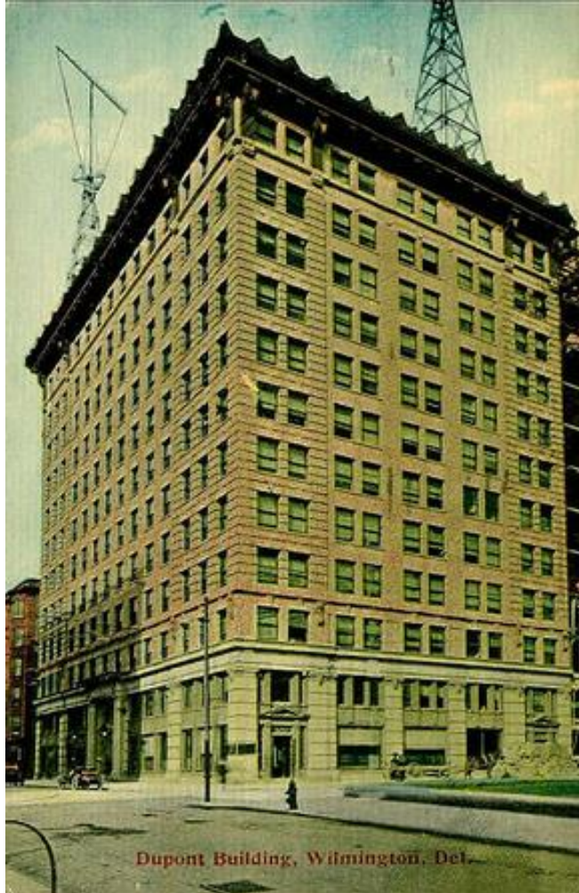
Dupont Building, Wilmington, Del.