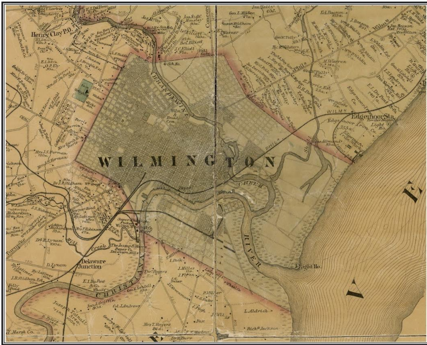
From the Map of New Castle County, Delaware 1881 G. W. Hopkins Reprint 2014 www.old-maps.com