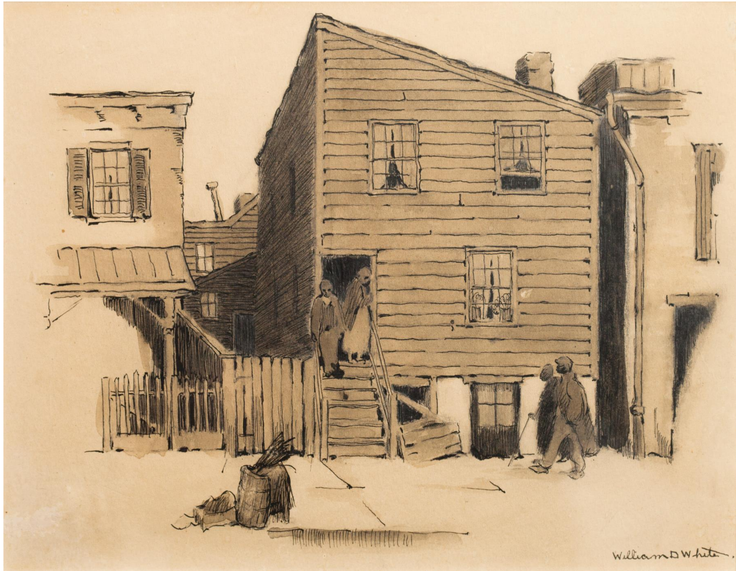
William D. White, Untitled (Wilmington east side neighborhood, c1938)